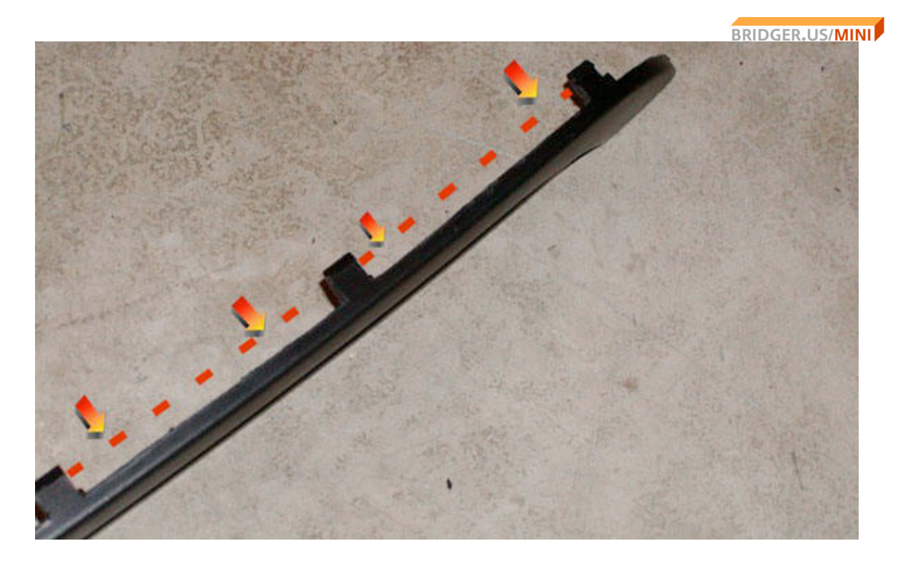
This is the top of the grille showing the portion removed there: